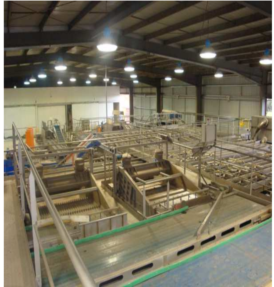
Carrot Processing Line Installation In Progress