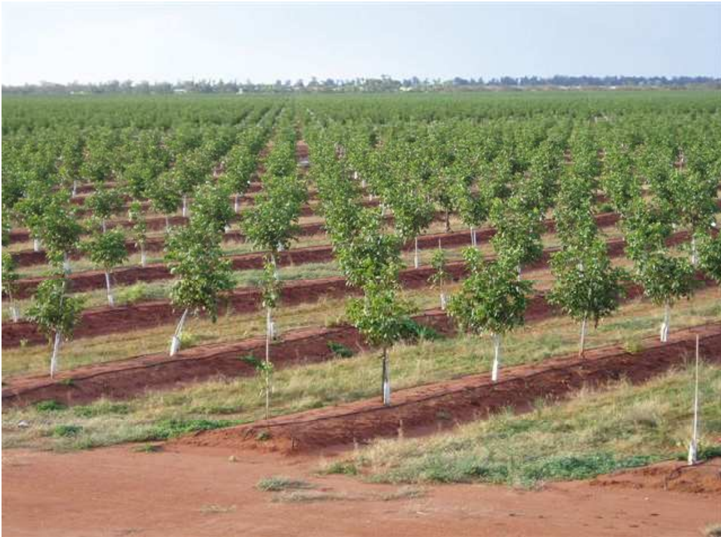
Tabbita Orchard – Second Leaf